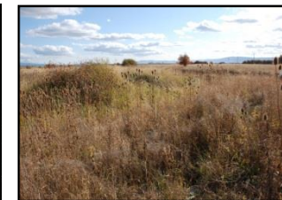
Before-After New Willow Channel