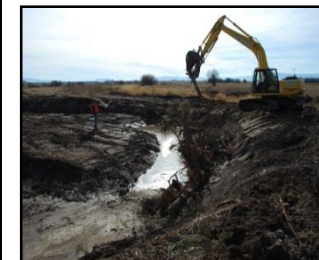
Willow Re-Activation Channel Planview